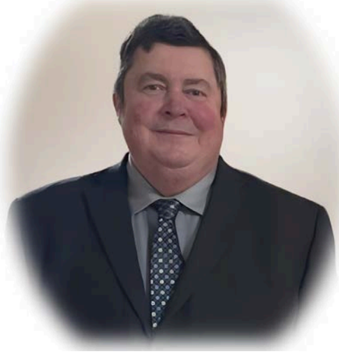
By Mayor Randy Lints